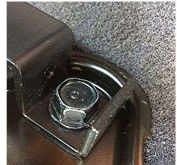
Clamps to seat rails or bolts onto seat frame points